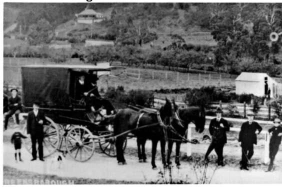
The view from Greensborough Station

HEALTHY SURROUNDINGS. It is 13 ½ miles from the city, or 36 minutes from Prince's Bridge station. It has a frequent electric train service, the weekly workman's ticket costing 4/8.