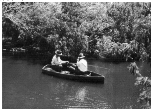
Fishing in the Plenty River

Anglers will find plenty of sport in the Plenty River. There blackfish, trout, cod, and eels abound.