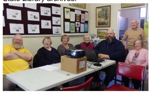
Members of the Thursday Crew share a laugh during a workshop session on the Digger database

We are now running training sessions on the 1st Thursday of each month at our History Resource Centre and so far, have covered getting the best out of DIGGER (Births, Deaths & Marriages), using and managing Victorian Collections and using our inhouse Digital Library. Future sessions will include accessing Ancestry, land title searches, Trove and accessing PROV and State Library archives.