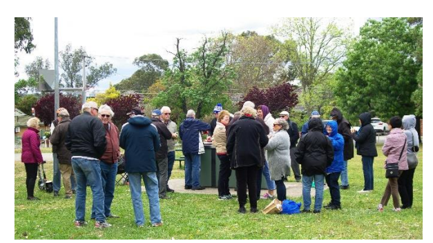
A good crowd of members and visitors arrived to share the BBQ and join the talks