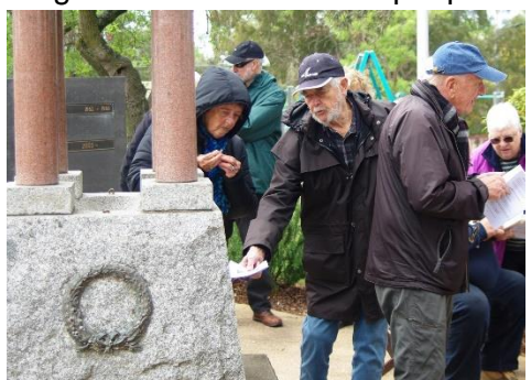
GHS members and visitors inspect the Fallen Soldiers' Memorial

We helped celebrate the Old Colonists' Association 150th Anniversary by attending Leith Park which is one of its facilities, there was a good turnout and a few people