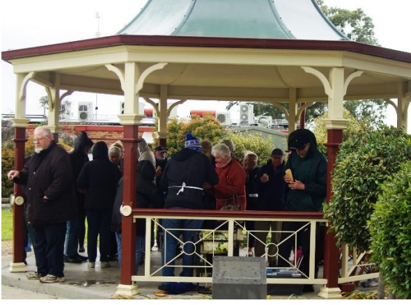
... And Melbourne weather struck once more, as bitterly cold turned to bitterly cold and wet! We sheltered in the Rotunda for a while then decided to abandon the day's activities.

If you would like to complete the walk around the Homefront Statues , we will try again on Tuesday January 14<sup>th</sup> 2020, beginning at 12 noon. No BBQ this time, but you can bring a picnic, or simply coma along for the 'walk and talk'. Meet at the McDowell Street end of War Memorial Park.