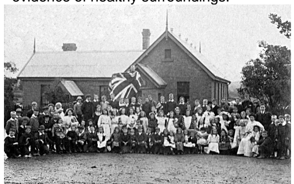
Greensborough State School 1907

Greensborough has a romantic history, and many old buildings in the district still stand as relics of the early days when Diamond Creek, its near-by neighbour, was the scene of feverish mining activity. Rapidly, however, the place is being modernised. The old is giving place to the new, and on the site of the old land marks are being erected up-to-date shops and buildings of all kinds. Ample shopping and public facilities are available. The State school itself has just been remodelled to provide for the increasing attendance of scholars. Their rosy faces and sturdy limbs are further evidence of healthy surroundings.