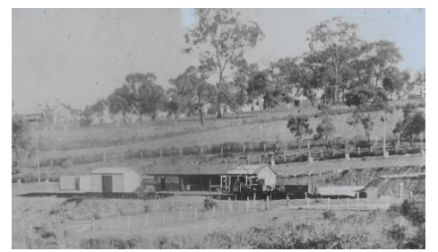
Greensborough Station, 1920s

Passengers had to change to a light steam train at Heidelberg, for their onward journey to Eltham. Sometimes there was a delay for the connecting train to begin its travel, so patience had to be exercised on these occasions [often this was because of the train losing steam and needing to build steam up again to continue its journey - Editor].