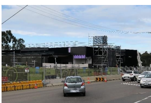
New Greensborough Station under construction, 2023.