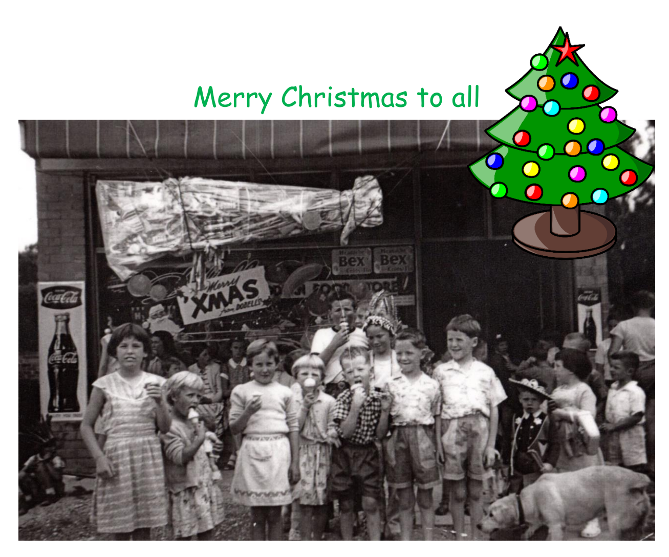
May all your celebrations be filled with family, friends and ice cream - just like these children at the Greenhills Milk Bar (this building is now the Clay Pot in Greenhill Road)